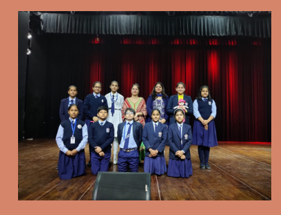
VEER BAL DIWAS CELEBRATION

As per CBSE guidelines, various activities were conducted in the school to commemorate the martyrdom of Sahibzadas.